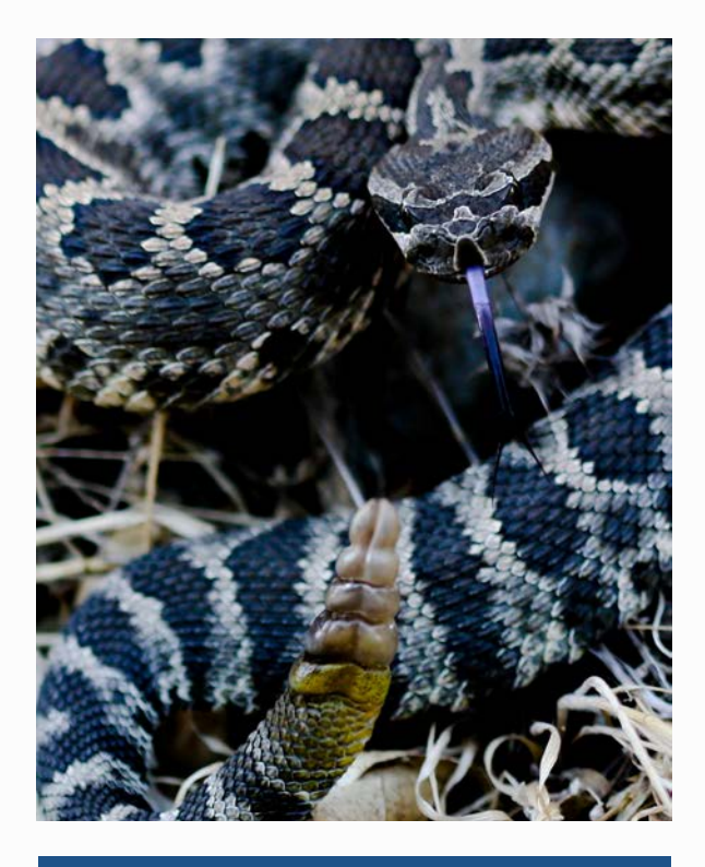
How do we treat pain with rattlesnake envenomations?